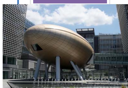
Charles K Kao Auditorium