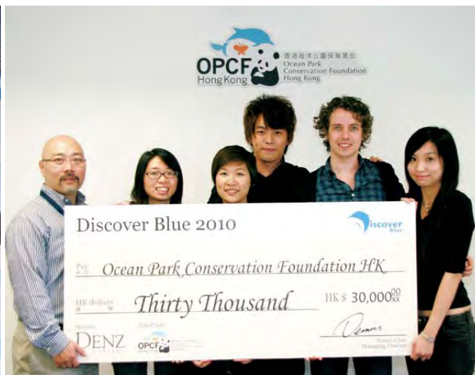
戴斯資本有限公司 Denz Capital Limited