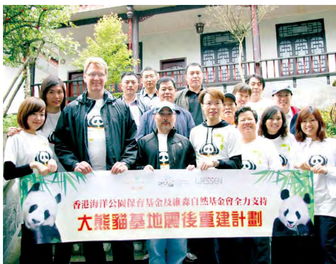
維森自然基金會 Wessen Group Foundation