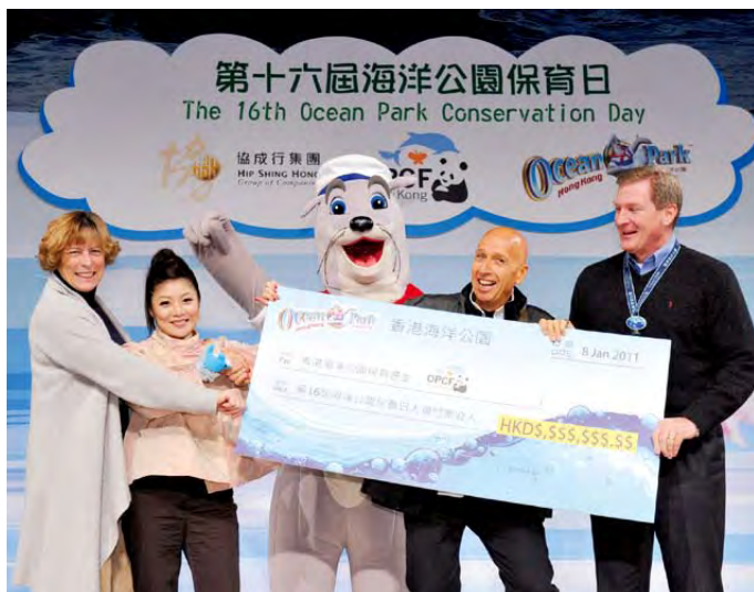
海洋公園 Ocean Park

Our conservation work would not be possible without the extraordinary support of Ocean Park. In 2010/11, Ocean Park contributed over $9.30 million to cover all our staff and administrative costs, and continue the protection of Asia's vulnerable ecosystems. We also offer our sincere thanks to the many other sponsors, donors, volunteers and Ocean Park visitors who helped sustain our work throughout the year.