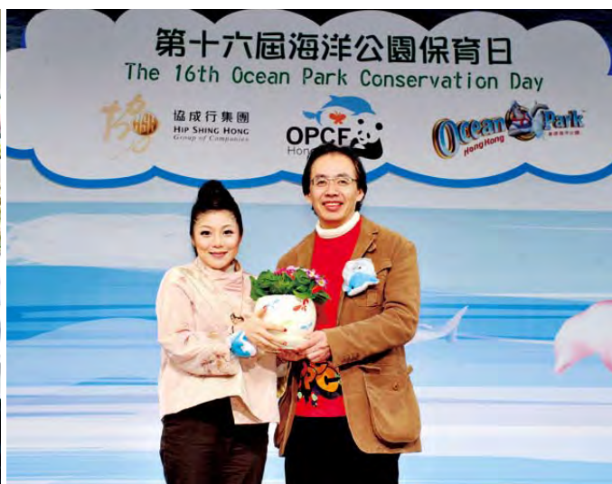
協成行集團 Hip Shing Hong Group of Companies