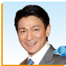
劉德華先生 JP Mr. Andy LAU, JP