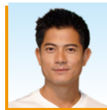
郭富城先生 Mr. Aaron KWOK