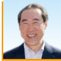
唐英年先生 GBS, JP The Hon Henry TANG Ying-yen, GBS, JP